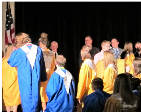
▲ Many students receiving the Four County Community Foundation's W. K. Kellogg Youth Advisory Committee scholarship.