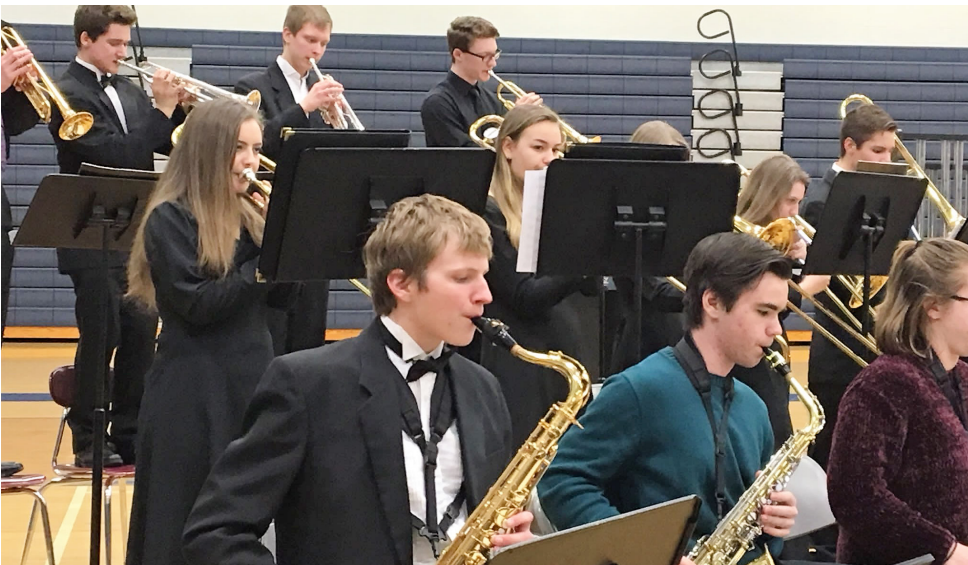
High School Concert Band ▲