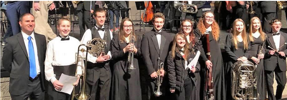
▲ MSBOA Honors Band